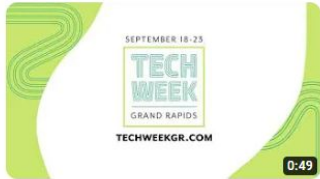
GVSU at Grand Rapids Tech Week 215 views · 13 days ago