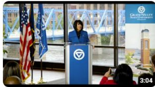
GVSU Enrollment News Conference 112 views · 2 weeks ago