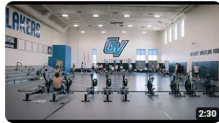
GVSU Wrestling - Impact Video 402 views · 12 days ago