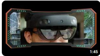
GR in XR GVSU Blue Dot Innovation District 139 views · 5 days ago