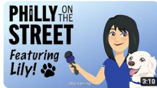
Philly on the Street - 2023 move-in 423 views · 1 month ago