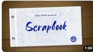
2023 GVSU move-in Scrapbook 68 views · 4 weeks ago