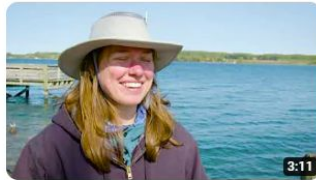
GVSU Learning to Solve Water's Wicked Problems in Traverse City 62 views · 12 days ago