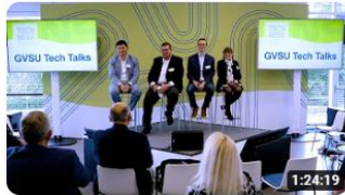
GVSU Tech Talks highlight work by faculty, staff 108 views · 5 days ago